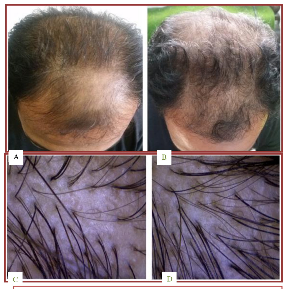
Figure 1: 32 years old male patient with AGA stage IV treated with microneedling with dutsteride. A -Clinical photo at baseline, B - Clinical photo after 6 month of treatment showing significant hair regrowth, C -Trichoscopic image (x50 folds) showing hair diameter heterogeneity and peripilar sign at the baseline, D -Trichoscopic image (x50 folds) after 6 months of treatment showing increased hair density per cm<sup>2</sup>.