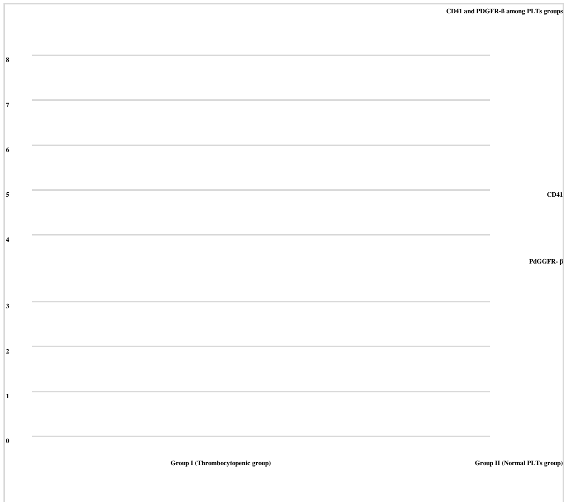
Fig (1): Comparison of Immunohistochemical expression of CD41 and PDGFR \beta among PLTs groups.