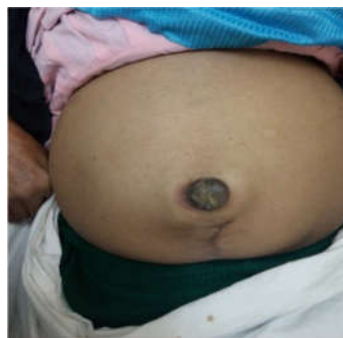
Fig (2): female patient 60 years with umbilical mass (Sister Josef nodules)