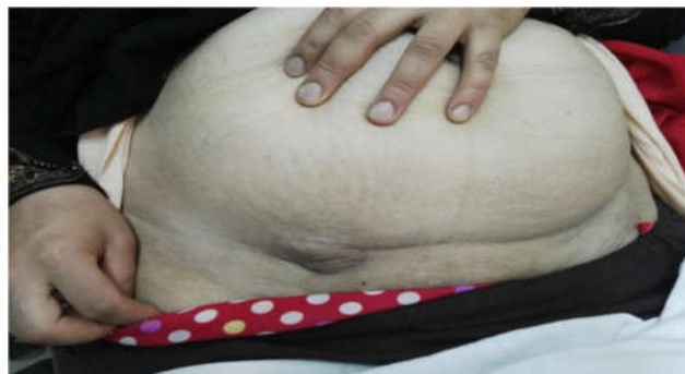
Fig (3): female patient 45 years with endometrioma at site of a previous cesarian section