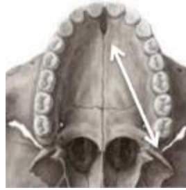
Fig 1. base of skull. arrow between greater palatine foramen and incisive foramen A) Site: 47% opposite 3rd molar. 27% opposite 2nd molar. 26% between 2 nd and 3rd molars (figure 2).