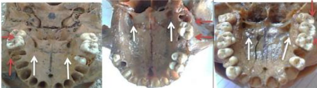
Figure (2): Site of greater palatine foramen (white arrow) (A): Opposite 2nd molar (B) opposite 3rd molar (C) between 2nd and 3rd molars (red arrows). B) Distance from incisive foramen: on the right side it varied between 30.01 to 40.94 mm. On the left side it varied between 32.1 to 41.4 mm (Table 1).