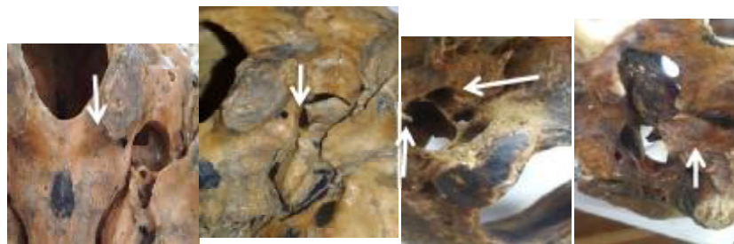
Figure (4): (A) dome (B) and (C) complete separation of jugular foramen. (D) partial separation of jugular foramen.