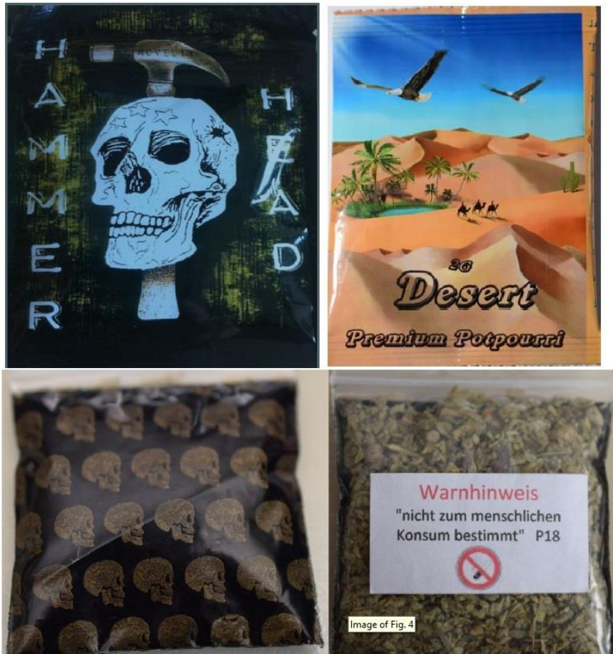
Figure (2): Different packages of SC labelled as not for human consumption [36].