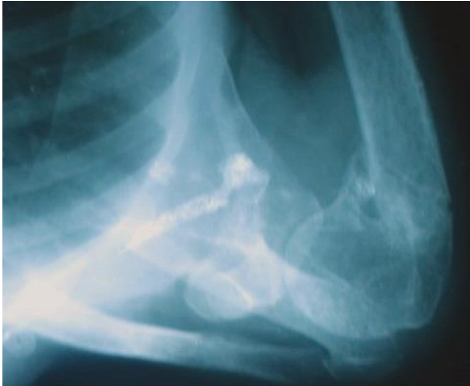
Fig 3. Malunioncase after 5 months follow up.