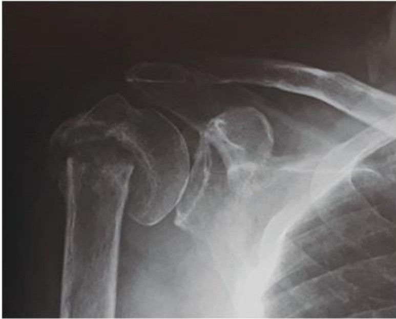
Fig 1. Nonunion case at 6 months follow-up with resorption of the surgical neck.