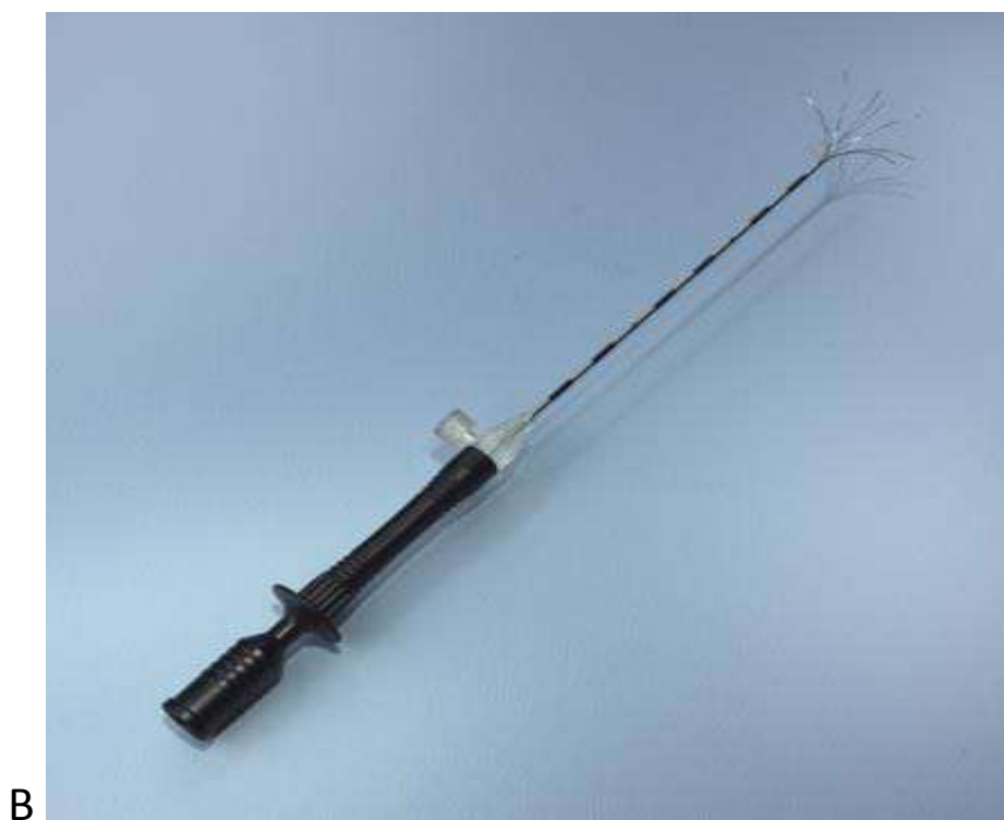
Fig.(1) A- Rita Electrosurgical Radiofrequency Generator Model 1500X