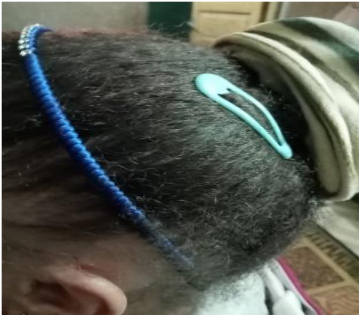
Figure (3) shows silver, grey hair.