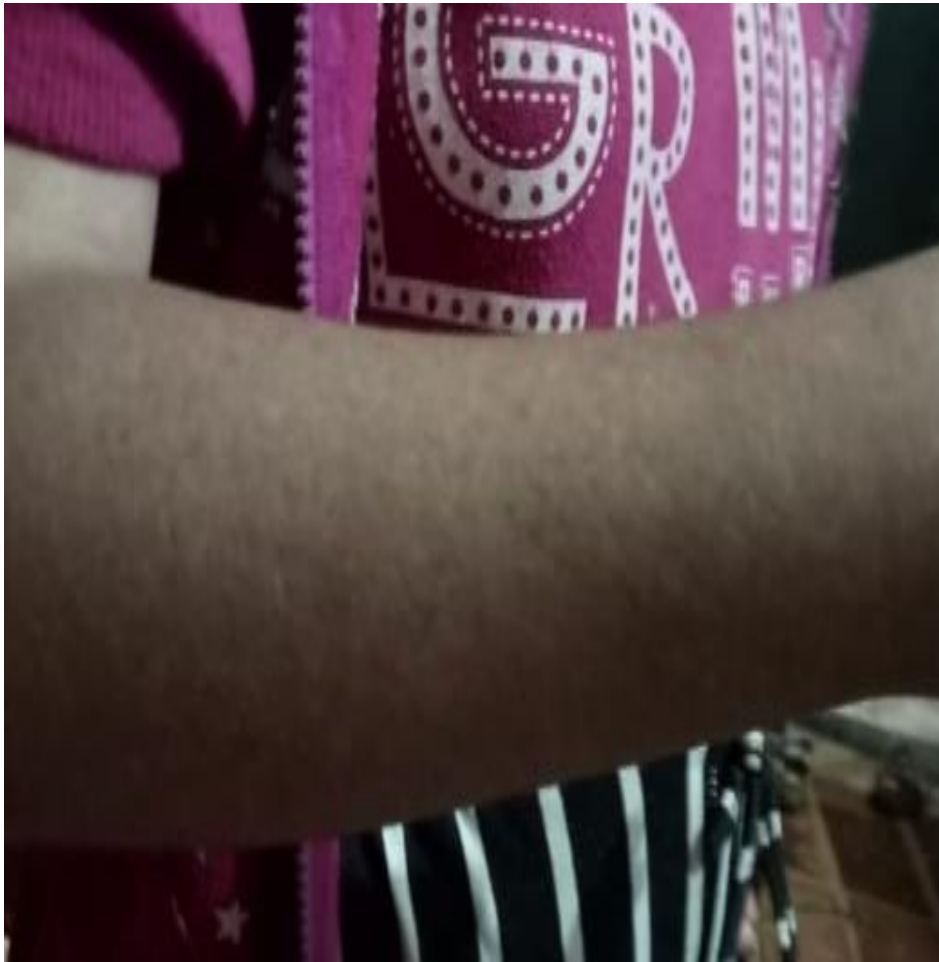
Figure (1): -Shows hypopigment-ation in the arm.