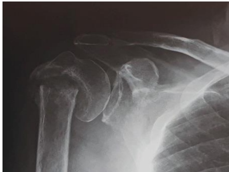
Fig 1. Nonunion case at 6 months follow-up with resorption of the surgical neck.

Nine cases (33%) showed nonunion(Fig 1) after 6 months while eleven cases (37%) show delayed union after 3 months.