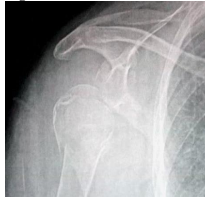
Fig4. Inferior subluxation of the humeral head.