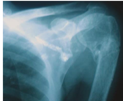
Fig 3. Malunioncase after 5 months follow up.