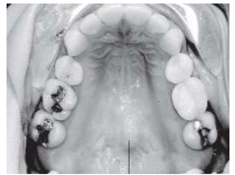
figure 2.palatine torus .After Garcia et al.,2010

finding is a normal variation, rather than an abnormality most commonly seen in Caucasians of northern European descent, Native Americans, or Eskimos. It tends to occur more in the females than in the males (Garcia, et. al., 2010).