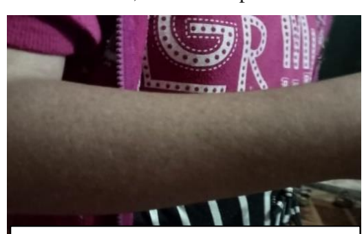
Figure (1): -Shows hypopigmentation in the arm.

(Tru cut biopsy) revealed atypical lymphoid infiltrate, immunophenotyping showed(CD 20, highlighting few B cells in aggregates); (CD3, highlighting many T-cells in interfollicular areas), (CD30, small lymphoblasts, no large cells); (CD15, scattered granulocytes, no large cells) compatible with reactive LN, B.M aspiration and