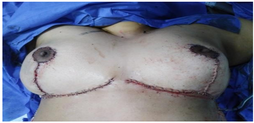
Figure3: postoperative view